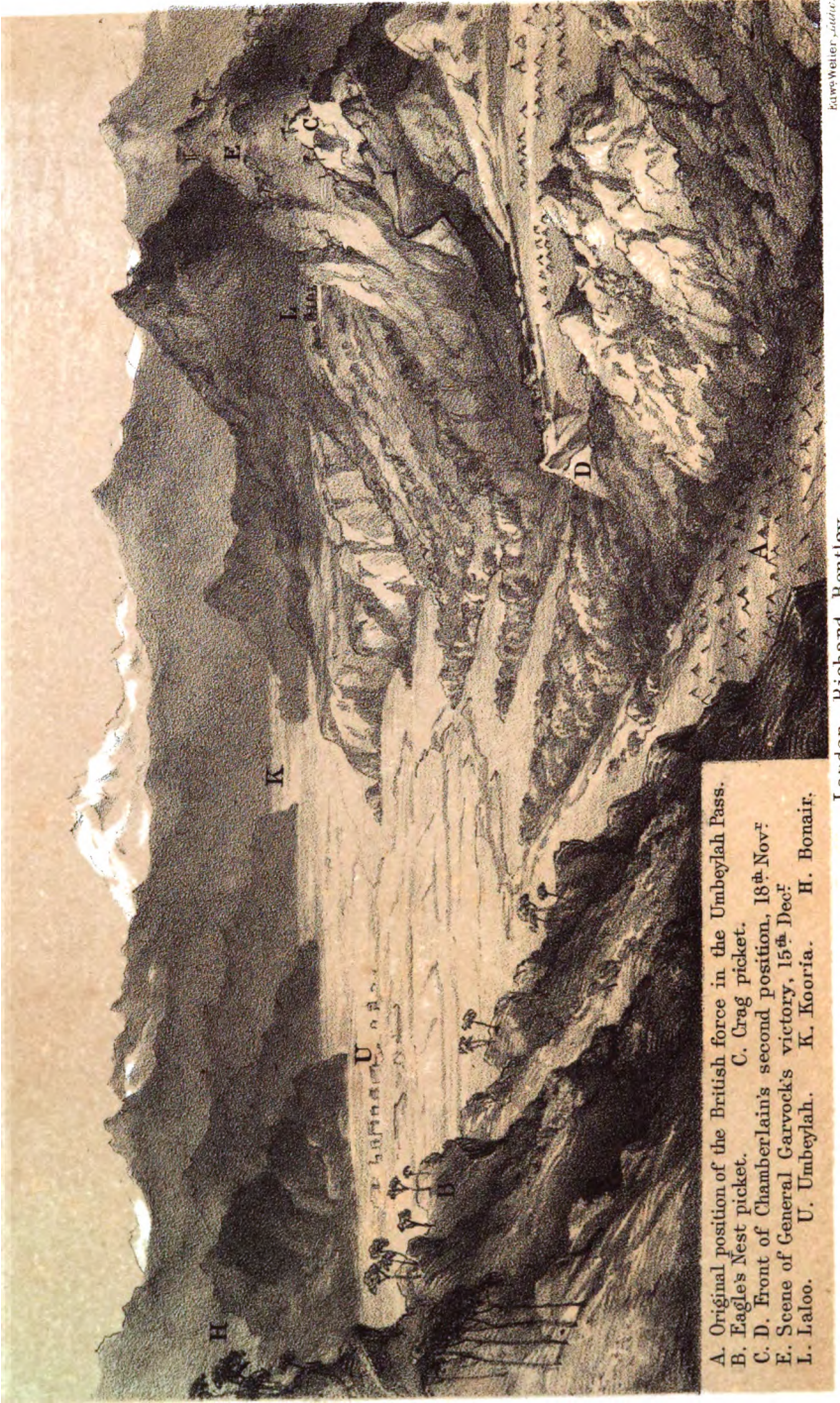
A. Original position of the British force in the Umbeylah Pass. B. Eagles Nest picket. C. Crag picket. D. Front of Chamberlain's second position, 18 th Nov. E. Scene of General Garrocks's victory, 15 th Decr. I. Laloo. U. Umbeylah. K. Kooria. H. Bonair.